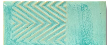
TD507 • Seafoam