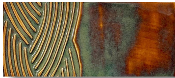
TD503 • Tidal Pool