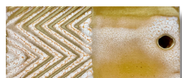
TD514 • Milk & Honey