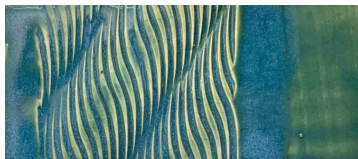
TD505 • Twilight Blue