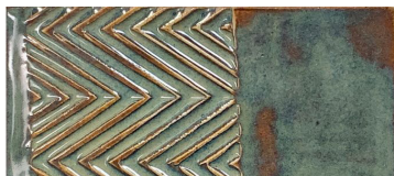
TD502 • Galaxy Blue