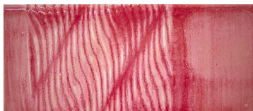
TD508 • Cherry Fizz