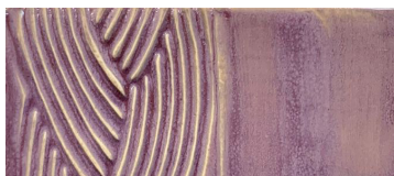
TD511 • Purple Velvet