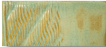
TD506 • Lichen Green