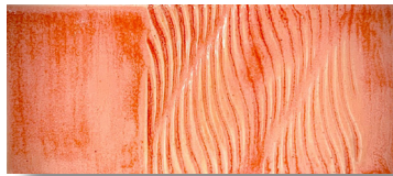
TD513 • Orange Neon