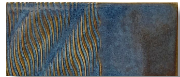
TD504 • Blue Dusk